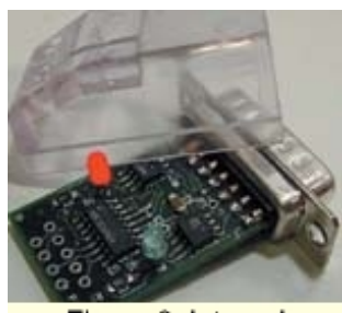
Figure 6. Internal clamshell and PCBA.

Size and PCBA layout design are instrumental to whether it is possible to overmold directly over the PCBA. The heat and pressures associated with the overmolding process can be a detriment to certain through-hole and surface-mount components. While the temperatures of the injected polymers do not typically cause reflow of the solder, the mechanical forces present in the injection process can cause damage to either the components or their electrical integrity to the PCBA.